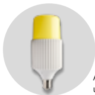
Appearance of lamp when un-illuminated