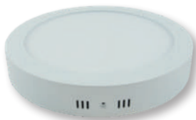
Surface Mount models available